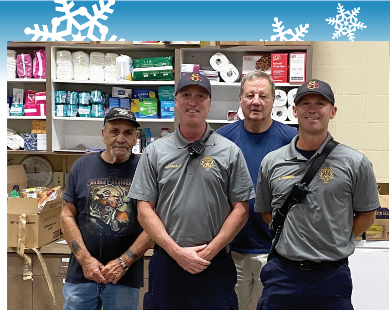
Members of the Shively Fire Department came by to help out in the food pantry

Canned soups, crackers, personal hygiene items