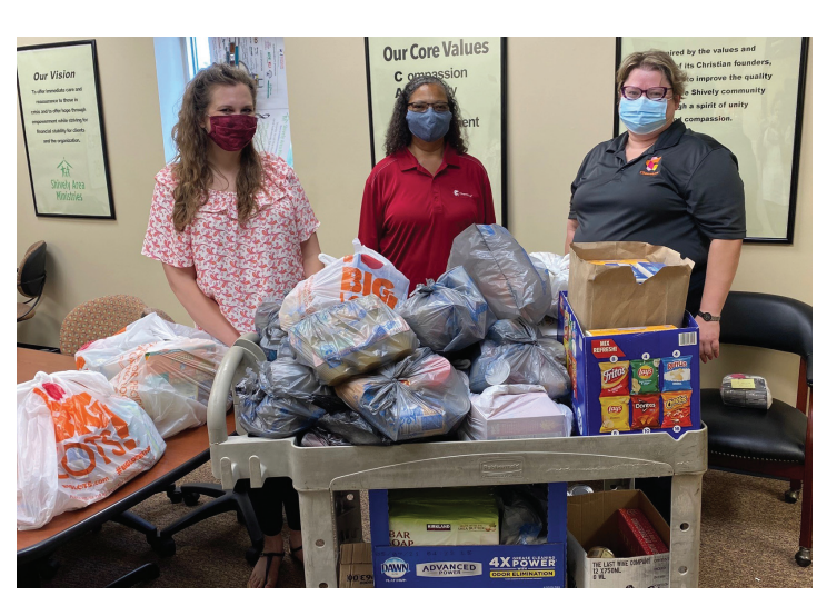
Chemours stopped by with some much needed personal care and other items for the food pantry